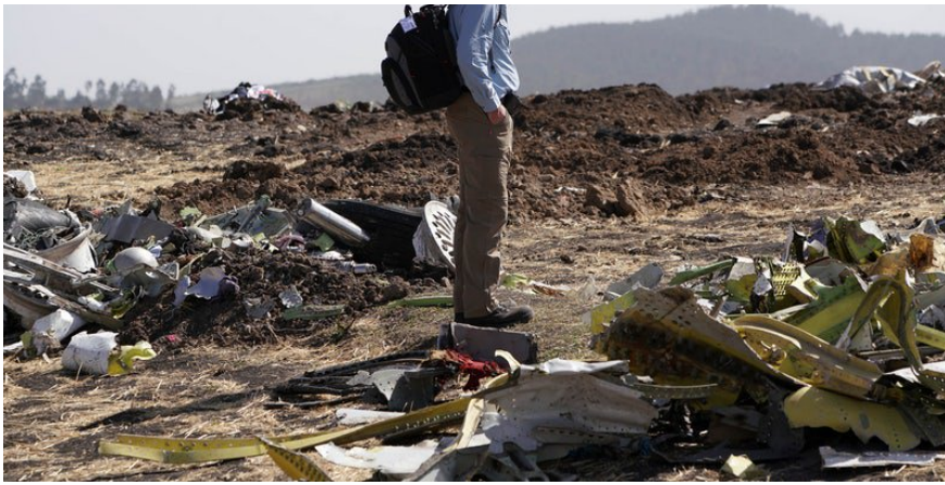
An investigator with the U.S. National Transportation and Safety Board (NTSB) looks over debris at the crash site of Ethiopian Airlines Flight ET 302 on March 12, 2019 in Bishoftu, Ethiopia.

You can say that a fatal design flaw killed all these people, but that’s actually just another way of saying that money did. It’s hard to square the Boeing behind that powerful beast with the subject of the awe-inspiring PBS series. With the crippling recession of the early ’90s an ever-present source of stress for Boeing managers back then, the company nevertheless marshaled $5 billion and 10,000 employees—5,000 engineers and 5,000 machinists, split into a few dozen “design-build” teams inspired by Japanese manufacturing practices—to develop the 777. Roughly $2 billion to $3 billion, in an era of rock-bottom interest rates and record airline profits, was detailed to the 737 MAX. [P] SEP